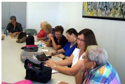
SE Chapter Meeting